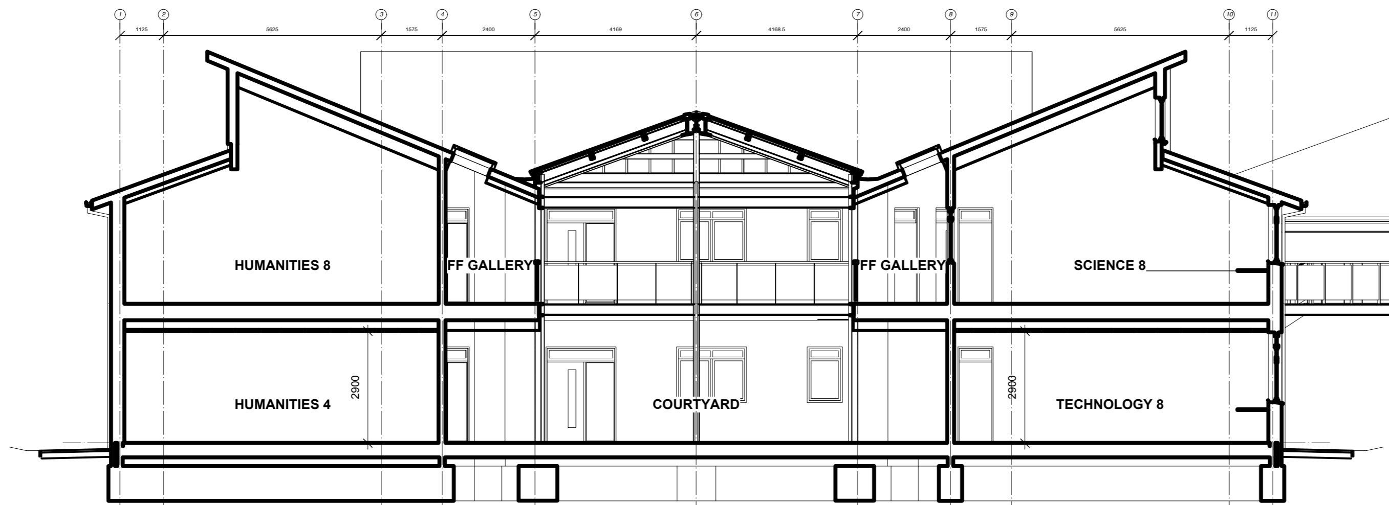
3 [Section Looking East] Scale: 1:100