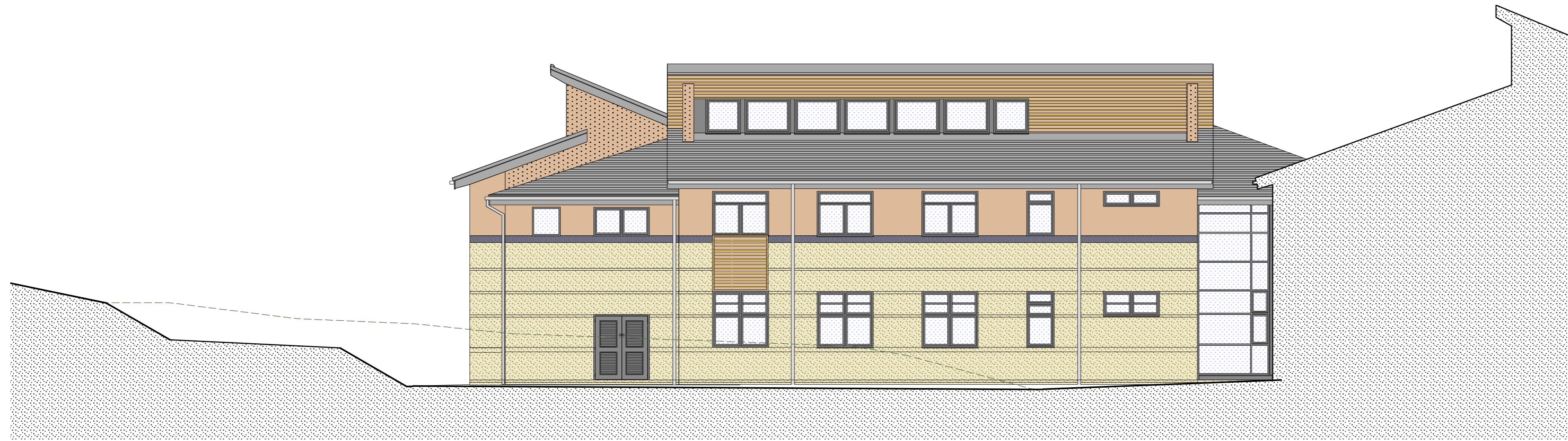
1 [South Elevation] Scale: 1:100

All loose furniture to be Client supply unless otherwise indicated.