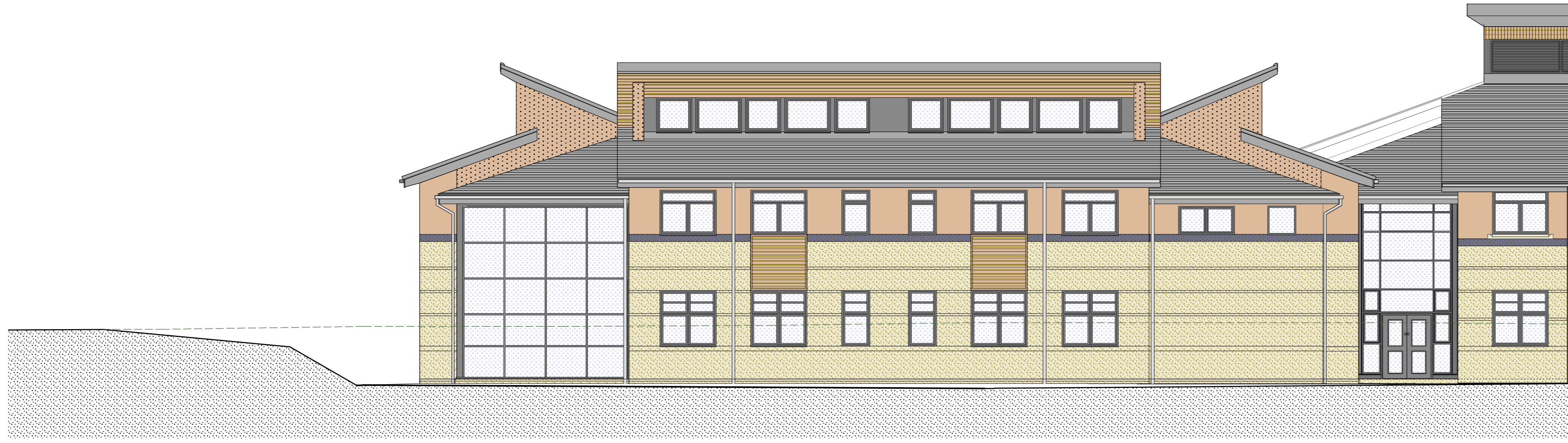
2 [West Elevation] Scale: 1:100